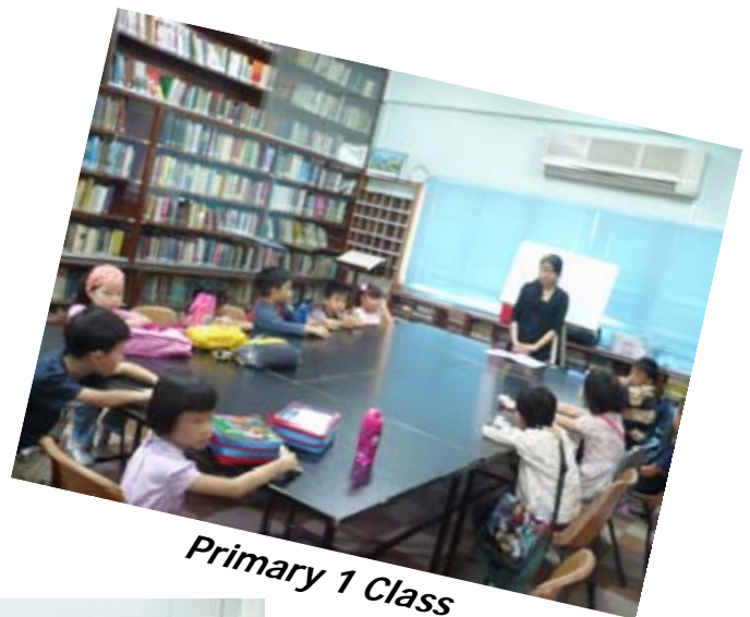
Primary 1 Class