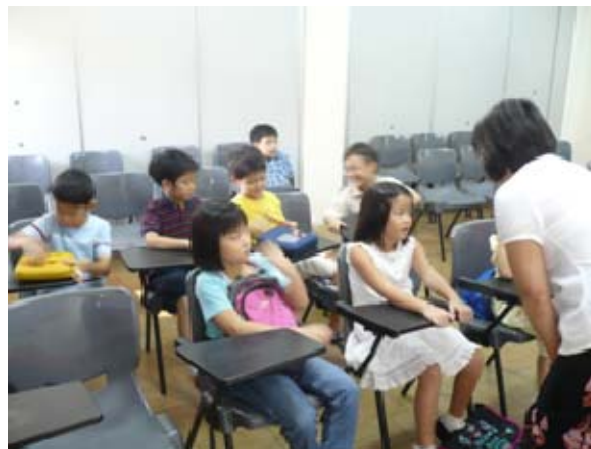
Primary 2 Class