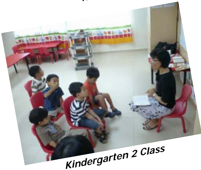
Kindergarten 2 Class