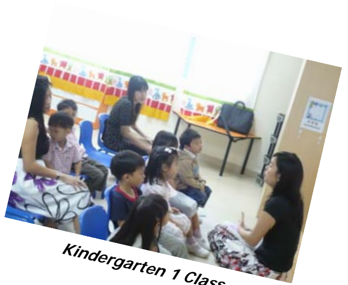
Kindergarten 1 Class