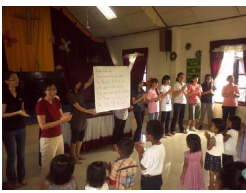
origami Teaching kids to sing "Jesus Loves Me"

was all smiles. children's The hospitality and enthusiasm upon seeing visitors and I uplifted my spirits. Despite language barriers between the village children and I, that did not make my duty of teaching them anv more