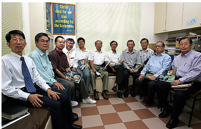
Adults 6 in the MF Room

So, do come and join us in this discussion how God can use you for His works here.