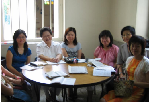
Adults 2 in the Beulah House SS Room