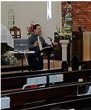
Adults 1 in the Sanctuary

class in understanding the Ten Commandments.