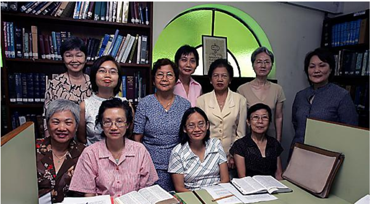
Adults 3 in the FEBC Resource Library

The Adult Sunday school goes to great depth to train and